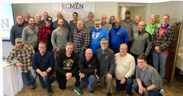
Men's Retreat Group Photo