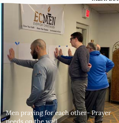
Men praying for each other- Prayer needs on the wall