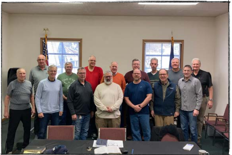
Thursday Morning Men's Bible Study Group

Every Thursday this group of men meet at 7:15 am for fellowship and Bible Study. This is an open group always welcoming new men to the group.