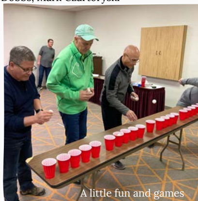
A little fun and games